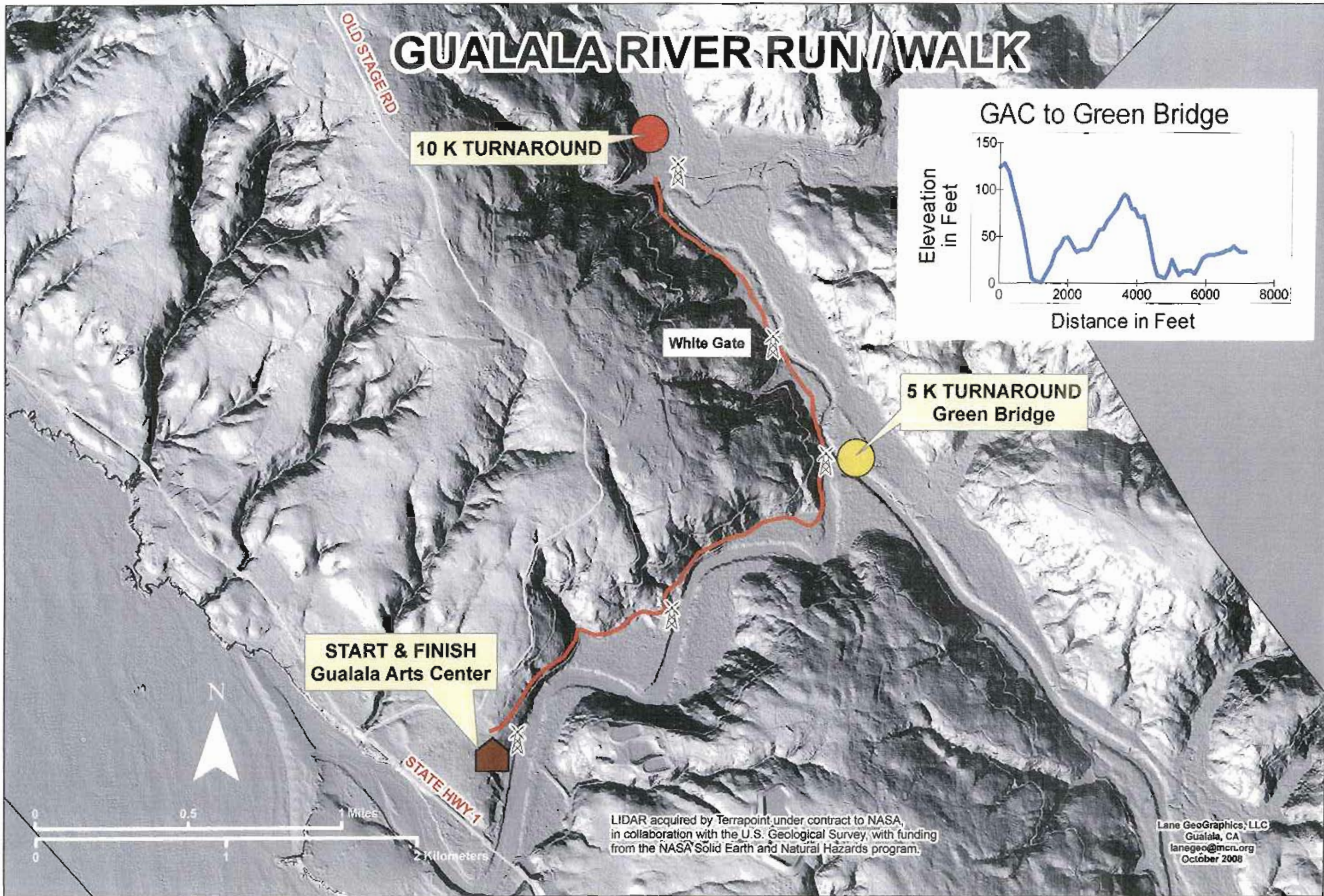
GAC to Green Bridge